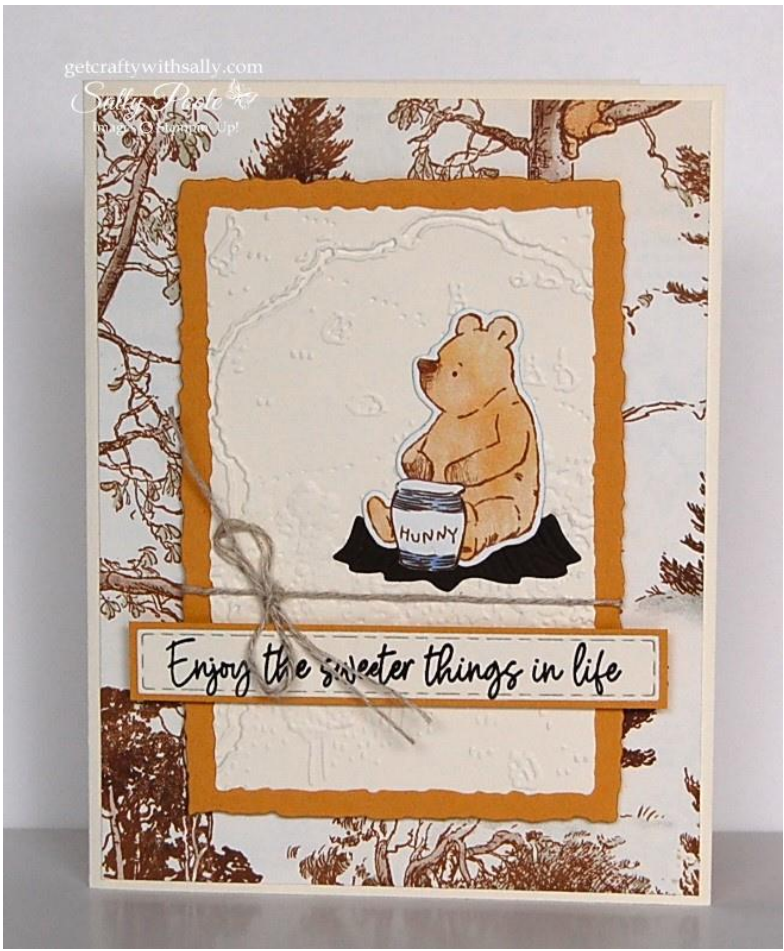
DECKLED RECTANGLES Dies. (3 rd largest – GOLDEN GLOW, 4 TH largest – VERY VANILLA.)