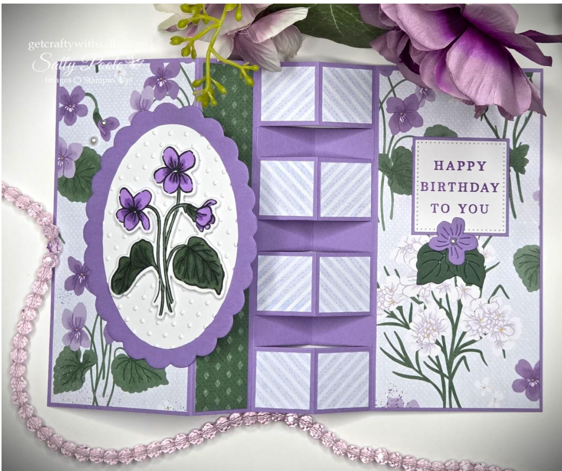
Cuttlebug embossing folder.