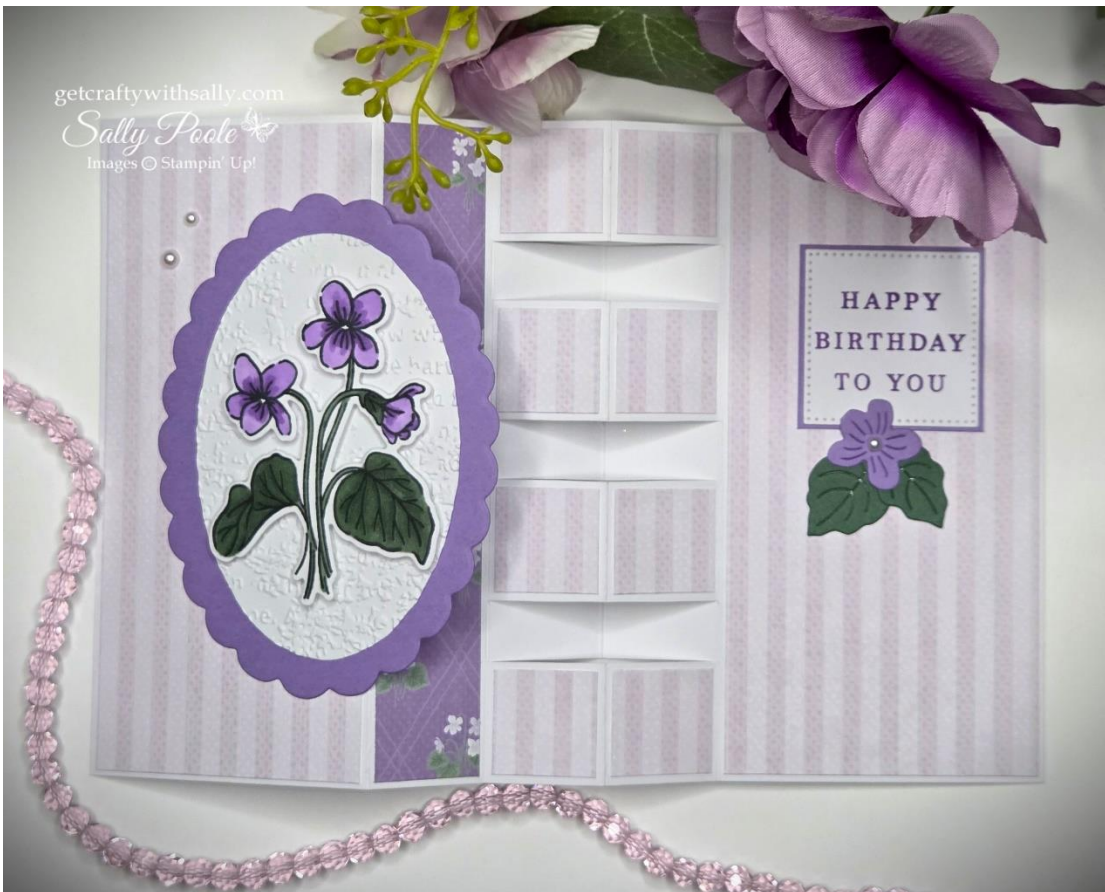
TIMEWORN TYPE embossing folder.