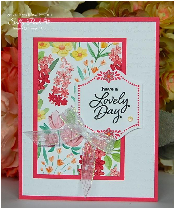
STRAWBERRY SLUSH cardstock.