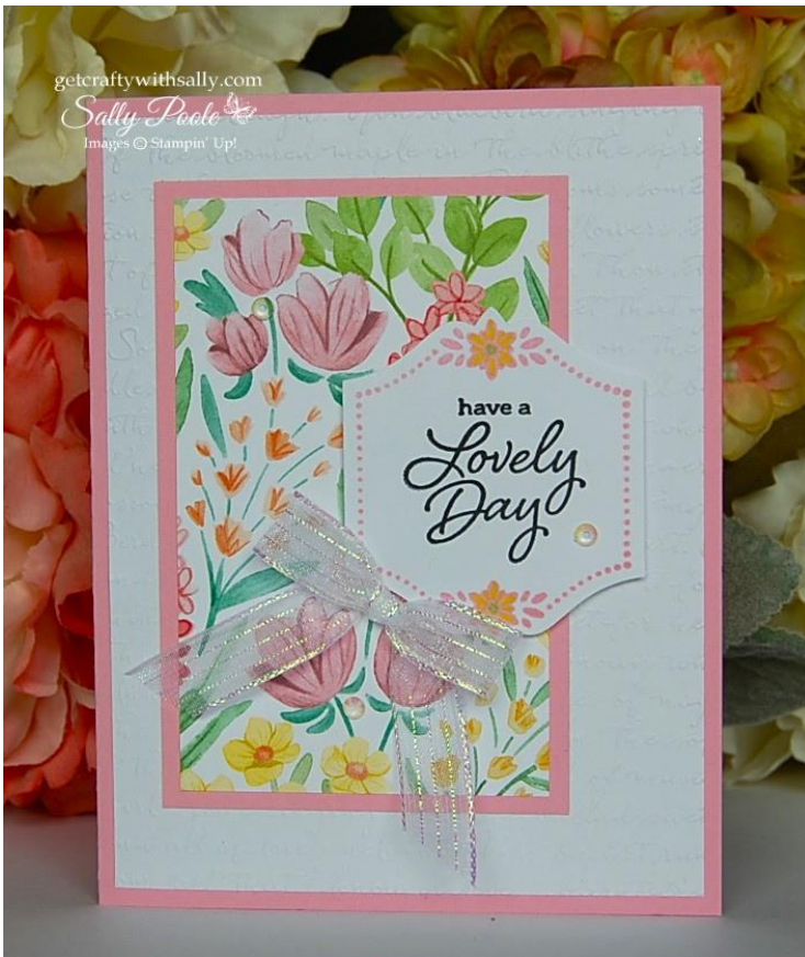
PRETTY IN PINK cardstock.