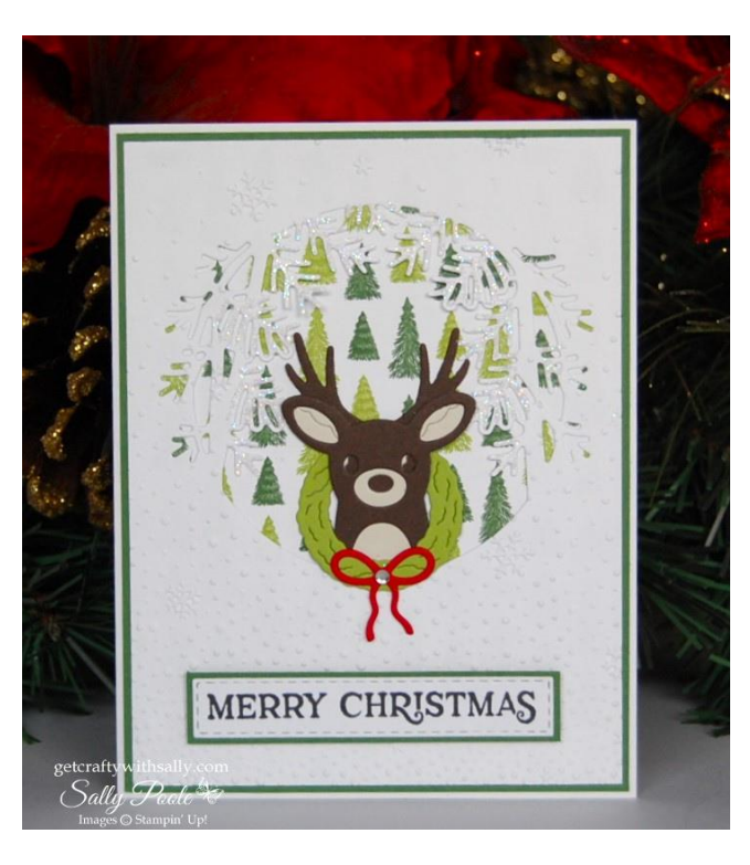
REINDEER DAYS DSP.

GARDEN GREEN and GRANNY APPLE GREEN cardstock.