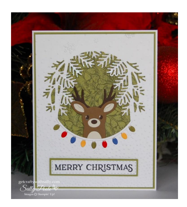
SEASON OF GREEN & GOLD DSP. OLD OLIVE cardstock.

GARDEN GREEN and GRANNY APPLE GREEN cardstock.