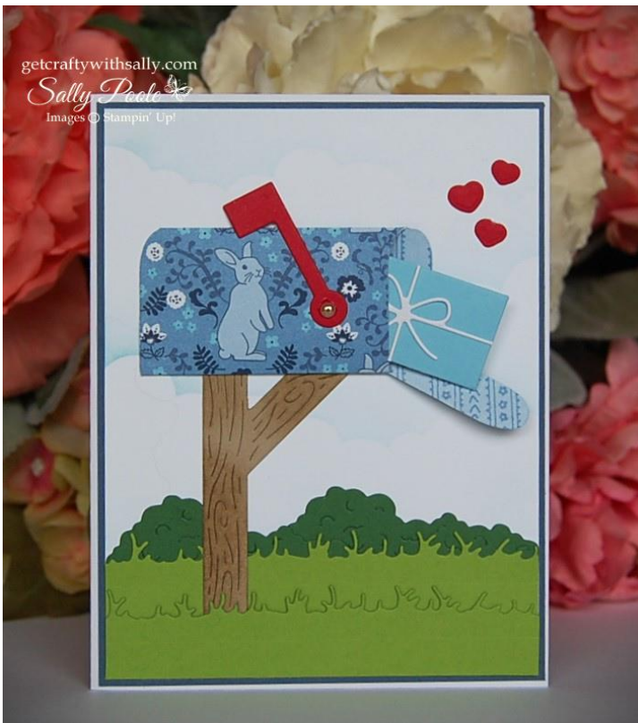
Countryside Inn Designer Series Paper – Annual Catalog Page 129