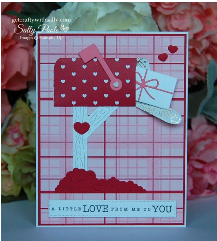
Most Adored Designer Series Paper – SAB Catalog Page 9