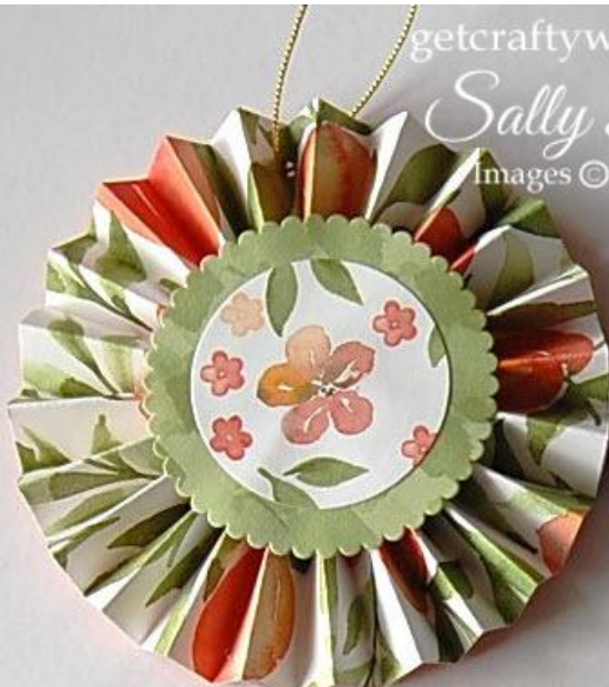
YOU'RE A PEACH