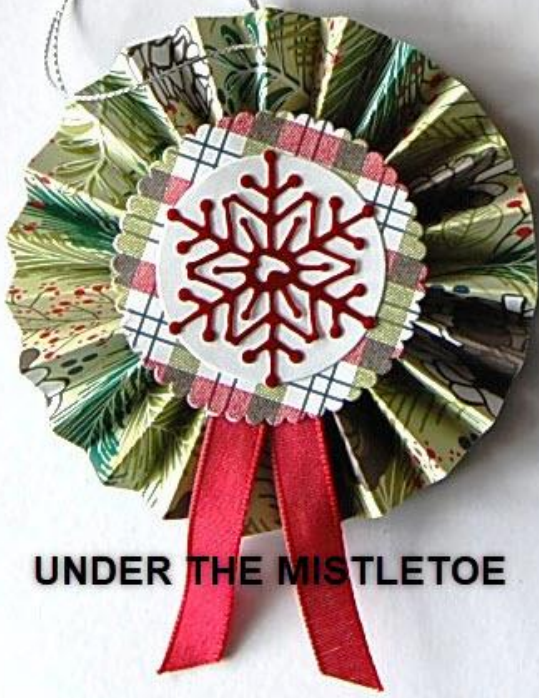
UNDER THE MISTLETOE