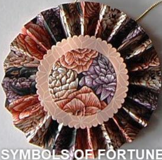
SYMBOLS OF FORTUNE